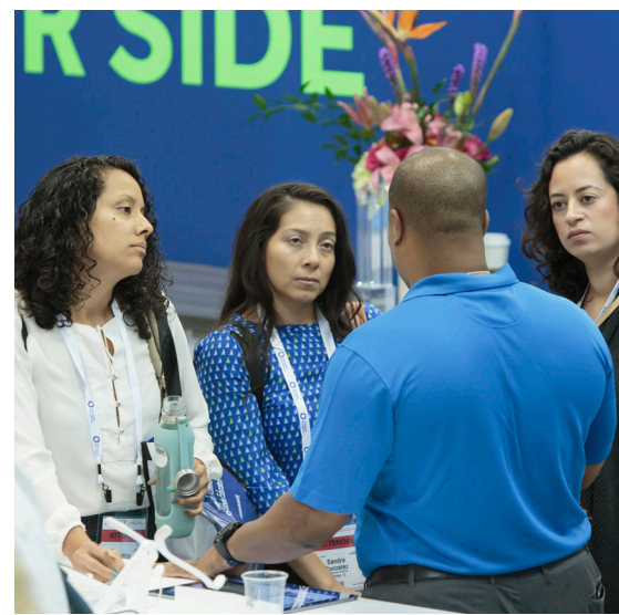
EXHIBIT HALL HOURS